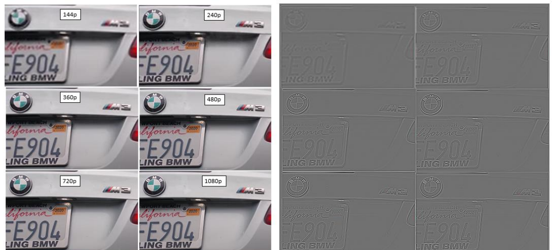
Figure 1: High pass filter yielding edge detection in the spatial domain

Compressed domain techniques can turn out to be more efficient than pixel-based ones. In some cases, like the subjective quality assessment, they may be the only practical choice too.