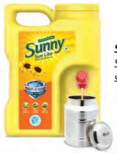
Sunny Sun-lite refined sunflower oil jar