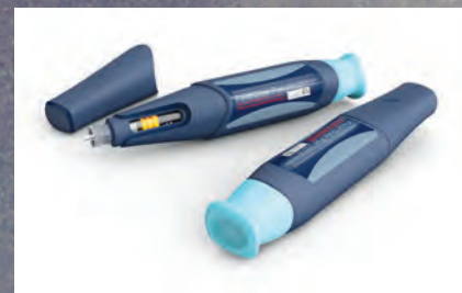
Innovation - Fixed Dose Pen for Drug Delivery

Tata Elxsi's Medical Device and Healthcare practice is ISO 13485 certified.