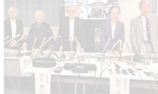
Nihon Hidankyo members at a press conference after the group won the Nobel Peace Prize

The honour rewards members' grassroots efforts to keep telling their stories, even though it involved recollecting horrendous ordeals during and after the bombings, and facing discrimination and worries about their health from the lasting