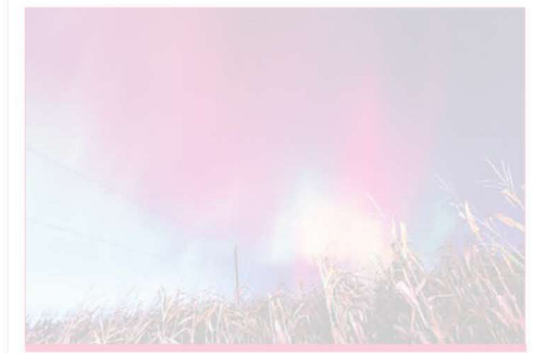
Solar storms brought the Northern Lights, or Aurora Borealis, to many parts of Europe, US and Canada this week. The sun had produced a strong X7.1 solar flare that led to mass ejections of the lights in multiple places