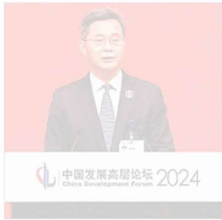
investors were hoping that the Chinese government would announce a stimulus package of up to $280 billion

The government has raised pensions and offered subsidies to people who trade in old cars or appliances for new ones, but